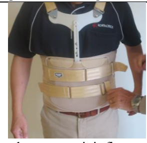
Step 8. Tighten the straps so it is firm