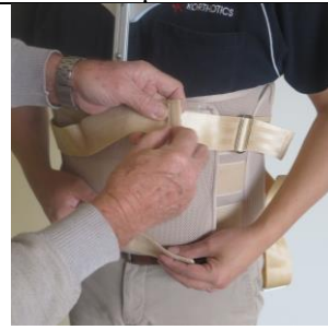
Step 6. Thread through the strap from the right side through the loop on the left strap