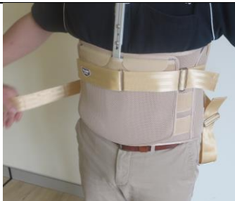
Step 7. Thread through the bottom strap from the right side to the loop on the left strap