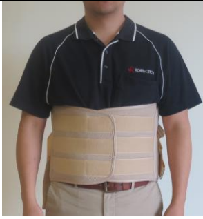
Step 1. Position the panels across with the velcro facing the front