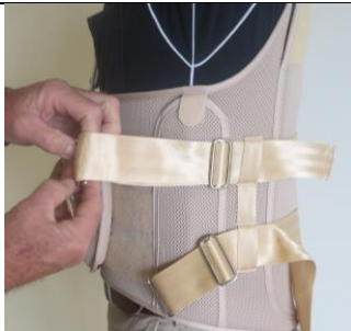
Step 5. Loosen the straps on the left side to the front