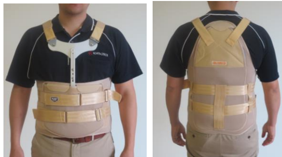
Step 9. Finished

If you require any further information, please call Korthotics on (02) 8710-4183 and ask for orthotic clinical team.