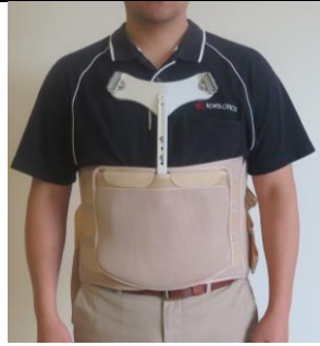
Step 2. Attach the anterior bar to the velcro on the front