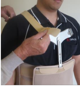
Step 3. Insert the strap on the right side of the anterior panel and tighten the strap